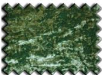
CV 11 – Octopus Green