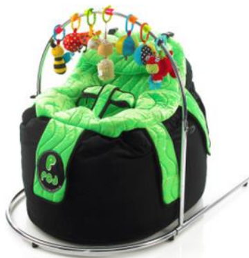
Activity Frame (Toys NOT included)