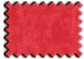
CV 13 – Starfish Red