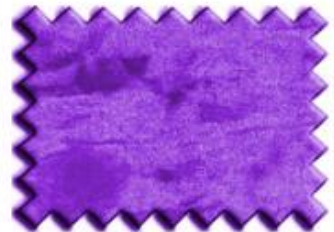
CV 9 – Jelly fish Purple