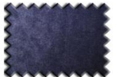
CV 10 – Dolphin Blue