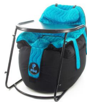
Free Standing Tray