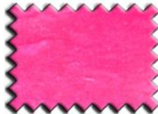
CV 4 – Mermaid Pink