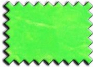
CV 6 – Seahorse Green