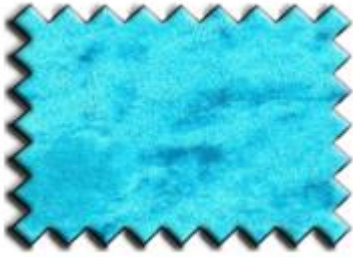
CV 5 – Pool Blue