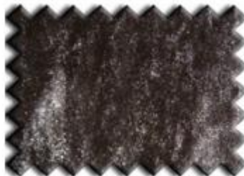
CV 12 – Sea Urchin Black