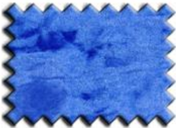
CV 8 – Whale Blue