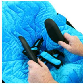
Lateral Trunk Bolster