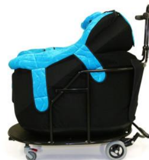
Mobile Base (Black Frame ONLY)